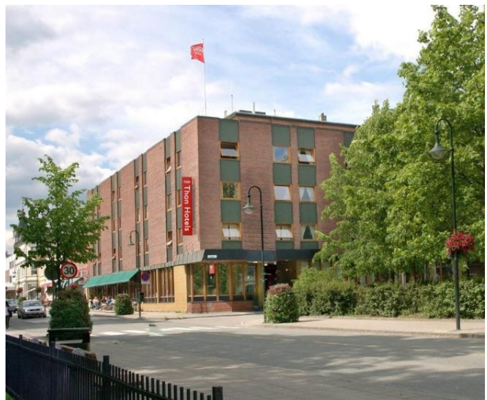
Route from Levanger train station to the meeting venue (left) and photo of the hotel and venue (right).