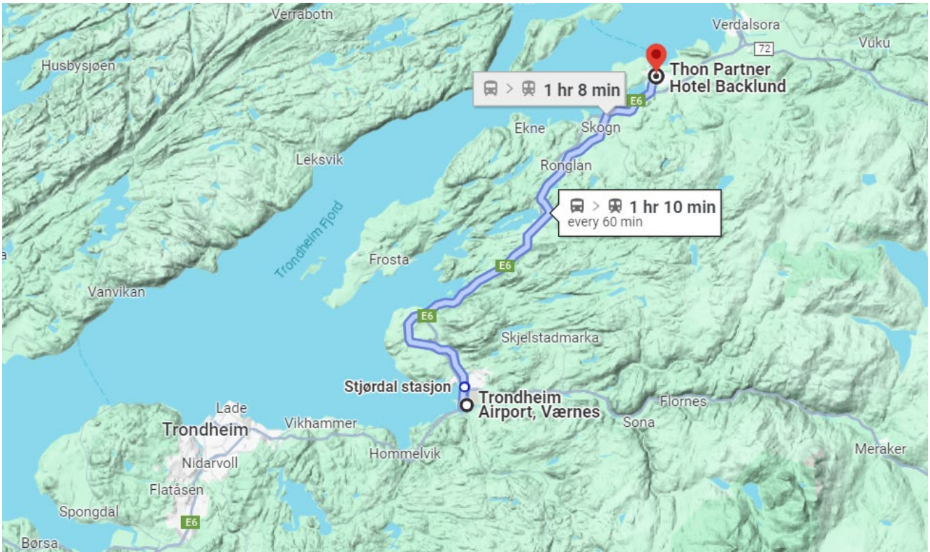
Example of public transport route from Trondheim Airport to the meeting venue (Google maps).