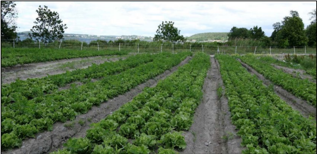
Protection of the lettuce crops through fences preventing goose families from entering the field from the seaside.