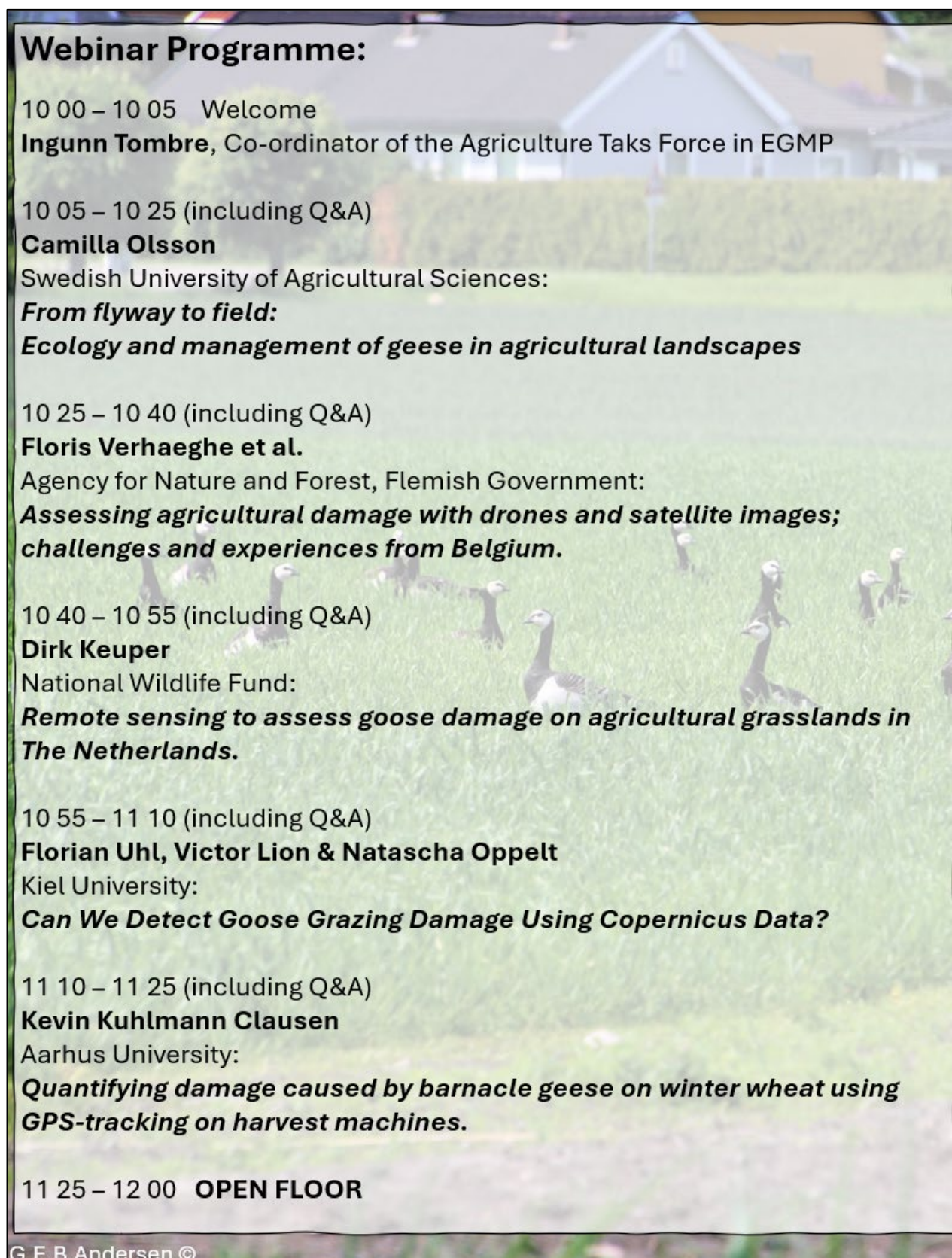
Figure 3. The programme of the EGMP webinar which will be arranged by Agriculture TF on 22 May 2026.